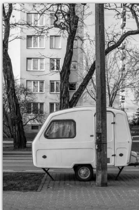
• Post „Fluctuations“

Moreover, I am sure that my creativity is also continually changing. I try to keep my creative flow not exceeding certain maximum and minimum limits, e.g., regarding the lack of artistic activity. I hope I can do it. I wish you the same, my Dear Friend. Hope you will be able to be creative for as long as possible. Preferably for the rest of your life.