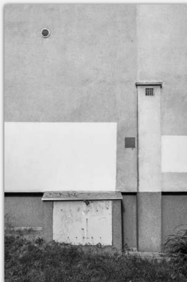
• Post „We know that we know nothing“

Nevertheless, for our galaxy, and even our solar system, this event would go unnoticed. It would not even be a symbolic part of our solar system. The same applies to a primitive tribe. It would be a historic event for the primitive tribe of the remote island. But what would such an event be in the face of the Universe's unimaginable vastness and infinity? We are stardust that thinks that it knows and means something (constant technological progress is supposed to prove it). In fact, our knowledge and broadly understood abilities do not cover the thousandth per mille of phenomena in the Universe.