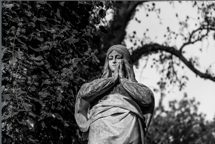
• Above post „Strangeness”